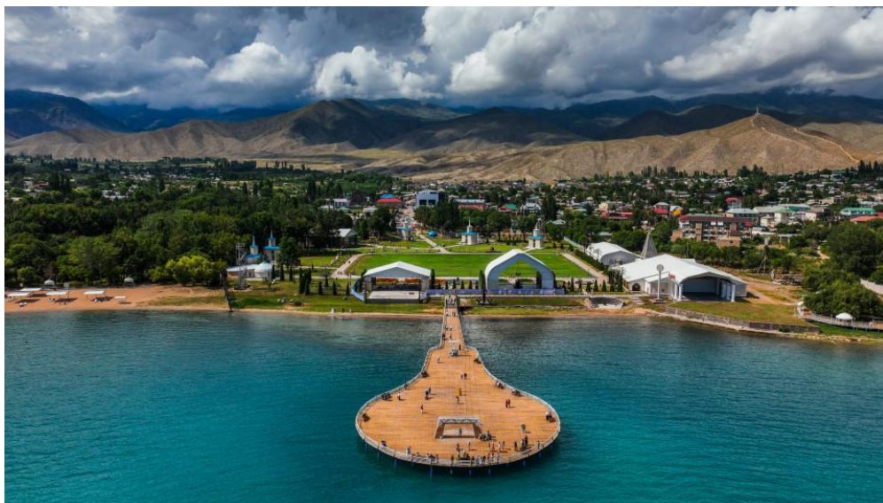
Fig. 1. The modern view of Lake Issyk-Kul

Comparative analysis shows that tourism in the Issyk-Kul region was historically established earlier and has gained international recognition. According to a joint study conducted by the Ministry of Economy and Commerce of the Kyrgyz Republic and the 2GIS service, by the end of August 2025, the number of tourist service facilities along the Issyk-Kul coastline had tripled compared to 2019. While in 2019 there were 360 public catering establishments operating in the Issyk-Kul region, by the end of the 2025 summer season their number had reached 963 [mineconom.gov.kg, 2025].